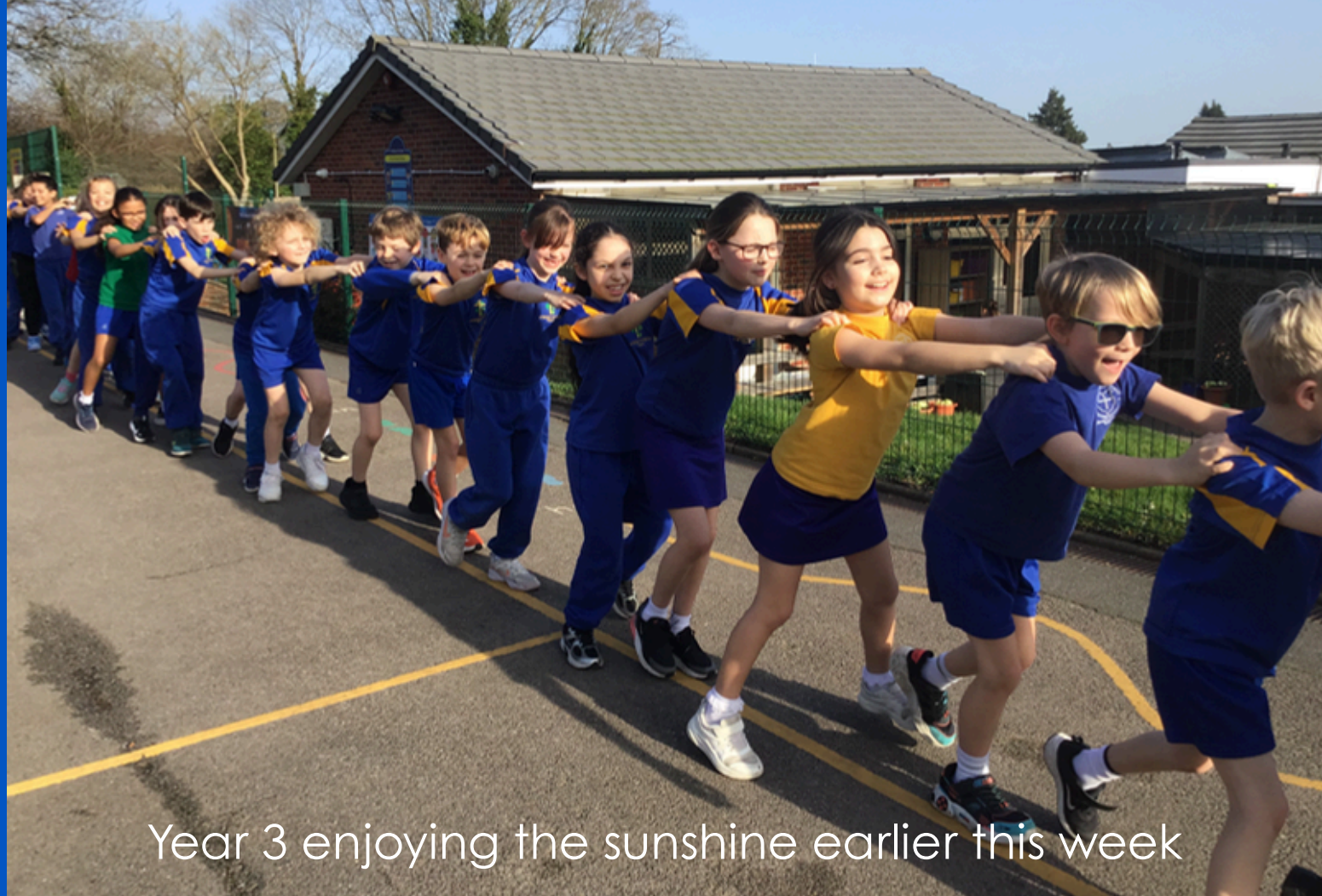
Year 3 enjoying the sunshine earlier this week