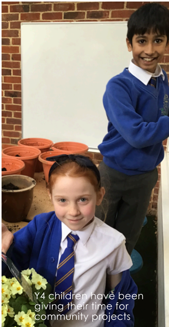
Y4 children have been giving their time for community projects