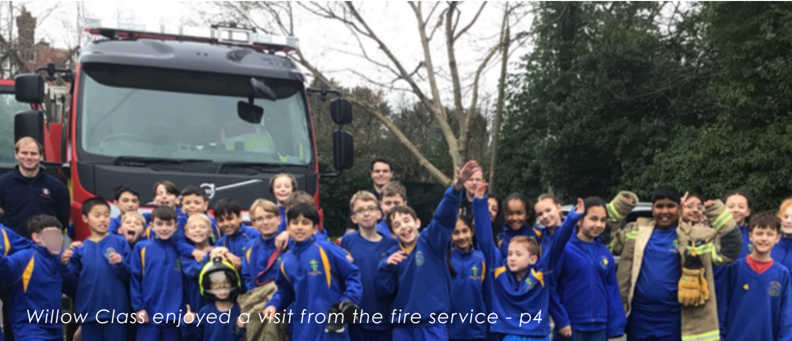
Willow Class enjoyed a visit from the fire service - p4