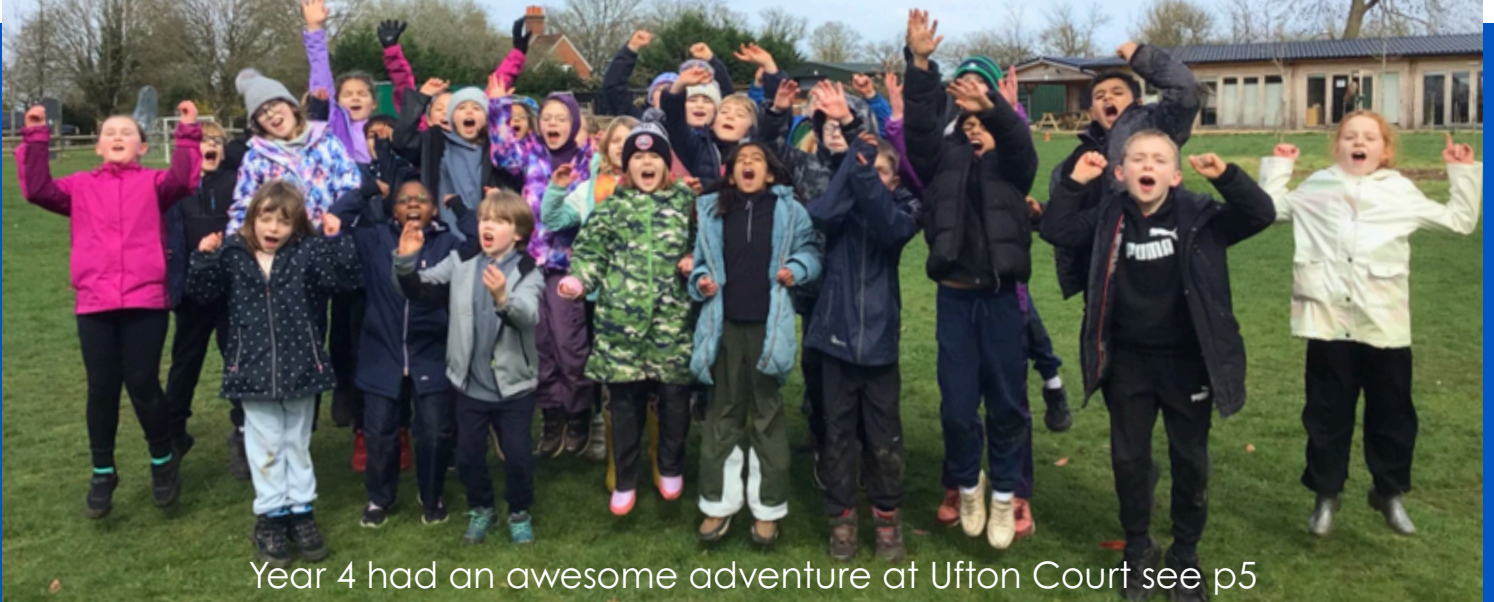
Year 4 had an awesome adventure at Ufton Court see p5