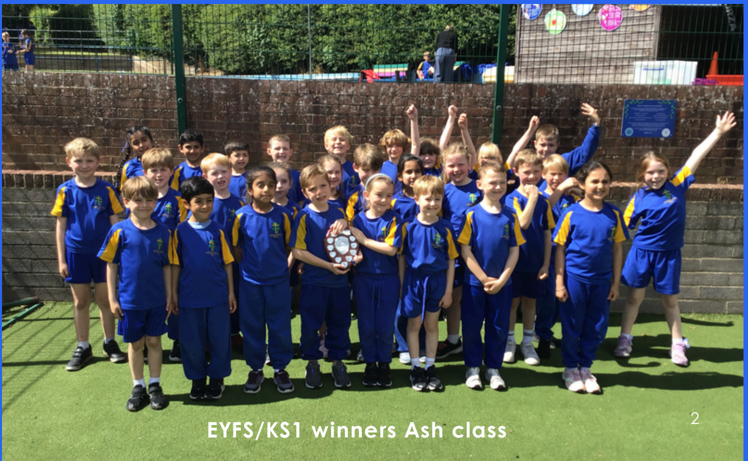
EYFS/KS1 winners Ash class