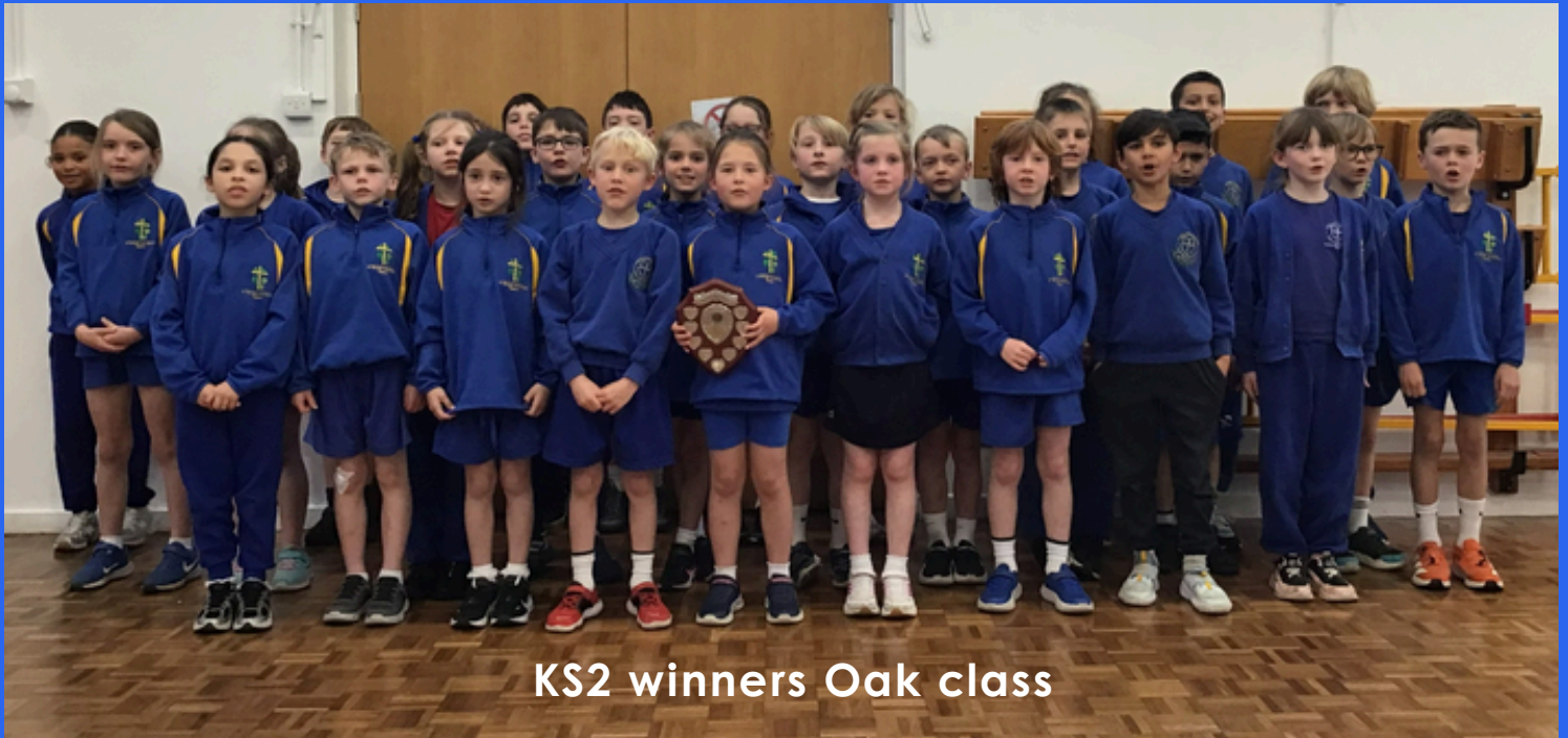
KS2 winners Oak class