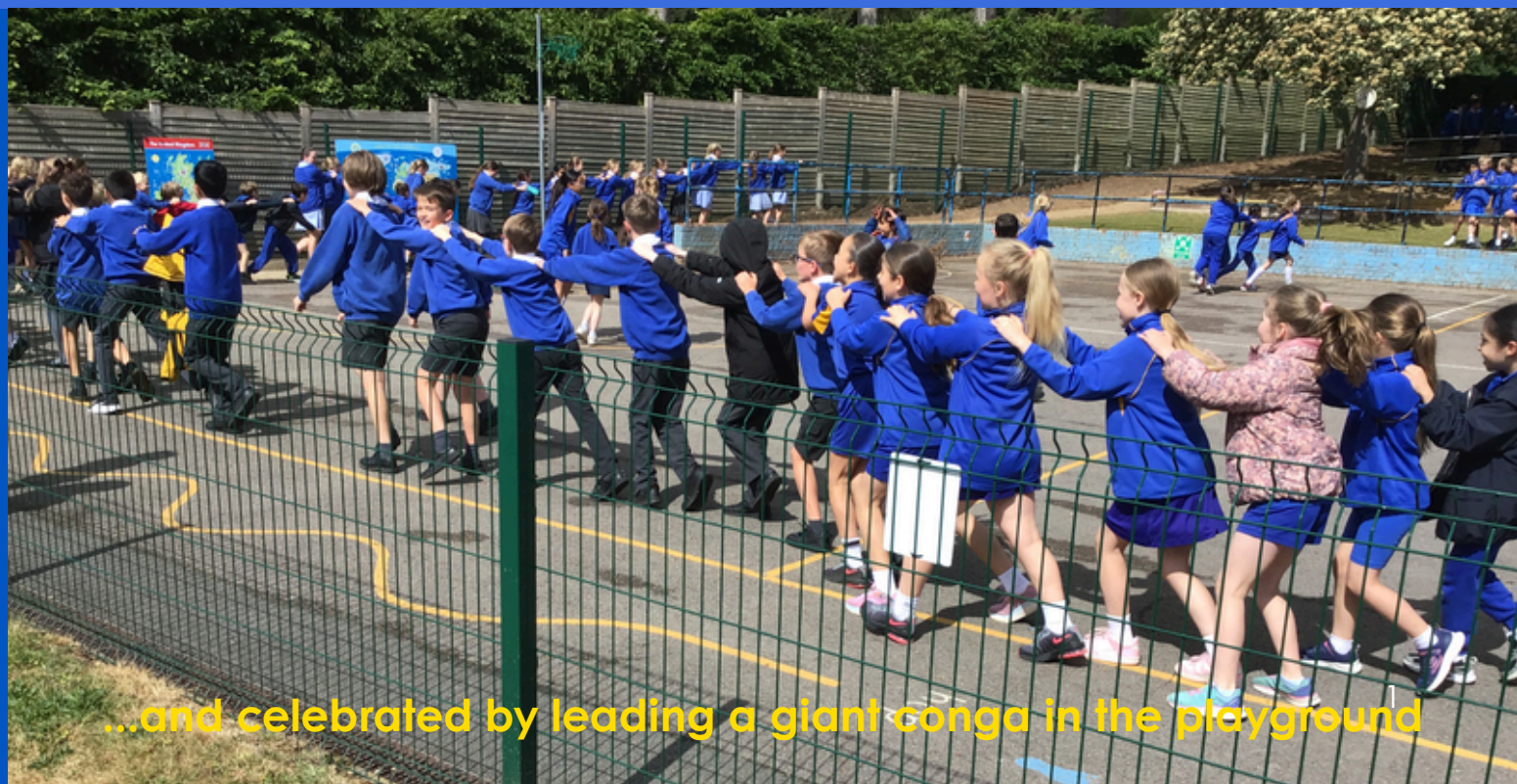
...and celebrated by leading a giant conga in the playground

Well done to Year 6, who completed their KS2 tests this week with determination and resilience. They have worked so hard this year and we are proud of their achievements!